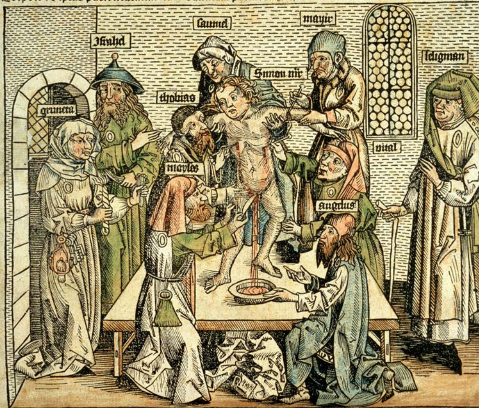
7 Jews and Christians, 1050-1450 II

From the Nuremberg Chronicle, 1493. Appendix plate