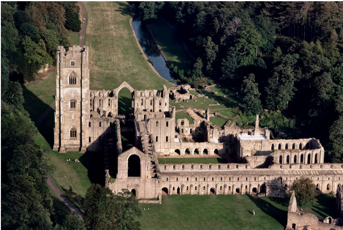
29 Twelfth-Century Monastic Life